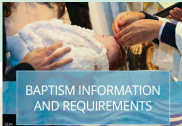
BAPTISM INFORMATION AND REQUIREMENTS

1a Santa Comunión, Confirmación, Bautismo (si no está bautizado)