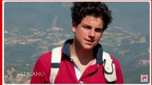
Blessed Carlo Acutis London, May 3, 1991 - Milan, October 12, 2006