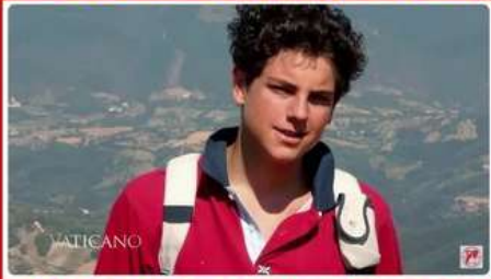
Blessed Carlo Acutis London, May 3, 1991 - Milan, October 12, 2006