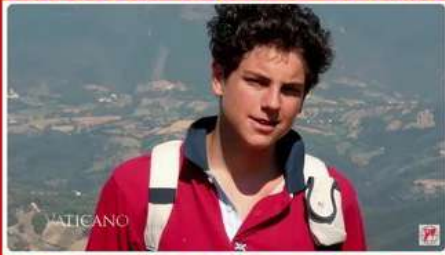
Blessed Carlo Acutis London, May 3, 1991 - Milan, October 12, 2006